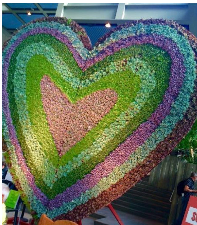
10' Succulent Heart & Art Glass - Photos by Cindy Walker

There are lavish garden displays and judged specimen gardens to dazzle the eyes and to give new ideas, and the garden books section is mind-boggling in its completeness. Attendees can avail themselves of jewelry, household goods, artworks, and trade show items at the many vendors. Cindy suggests bringing large sealable bags and rubber bands to pack purchased plants and small items in. Bring an oversized suitcase to be able to pack treasures in for the trip home. FedEx has a booth in the building to assist in shipping home larger items. An event well worth attending!