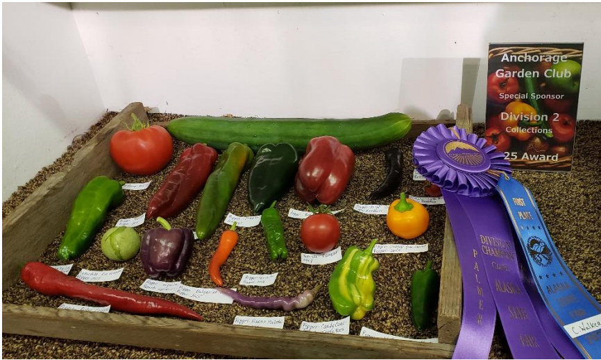
Cindy Walker Collections - Indoor Grown (left) Outdoor Grown (below)