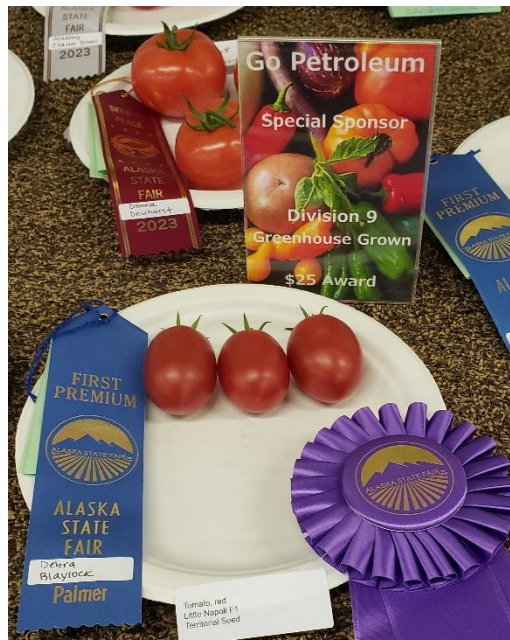
Deb Blaylock - Greenhouse Grown Cucumbers and Tomatoes