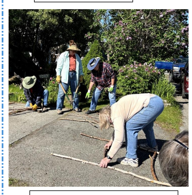
A gardening stance we are all familiar with!