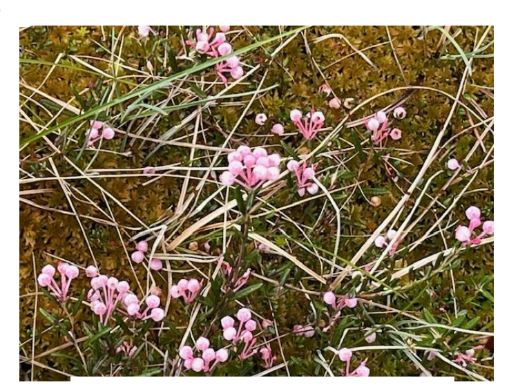
Bog Rosemary/Andromeda polifolia

A trip to the Southeast town of Petersburg in late May/early June gave Annita the opportunity to find these special wildflowers in glorious bloom. The use of umbrellas to protect garden boxes on the deck is a unique idea due to the rain received in this area. Repurposing at its best!