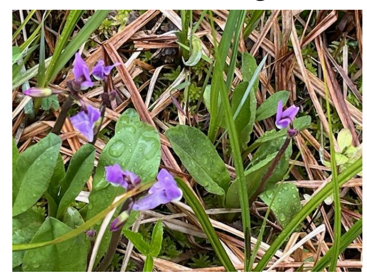
Frigid Shooting Star/Dodecatheon frigidum