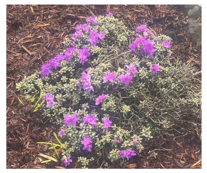
Lapland Rosebay/Rhododendron lapponicum