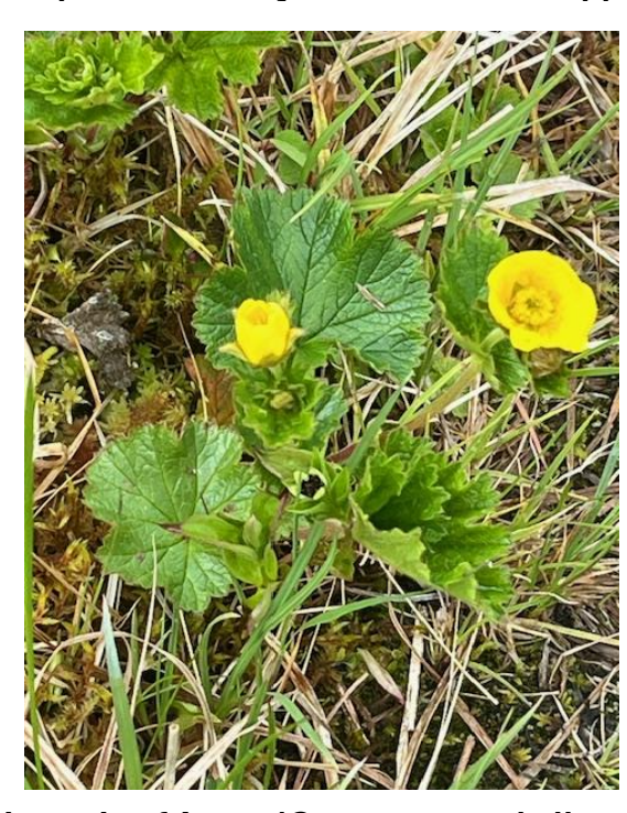
Large Leaf Avens/Geum macrophyllum

A trip to the Southeast town of Petersburg in late May/early June gave Annita the opportunity to find these special wildflowers in glorious bloom. The use of umbrellas to protect garden boxes on the deck is a unique idea due to the rain received in this area. Repurposing at its best!